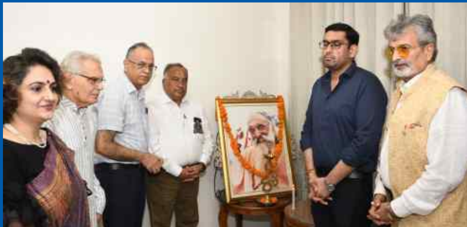
Joint Project of Rotary Club Amritsar Midtown with Vansaprastha Sanstha & Rotary Club New Amritsar