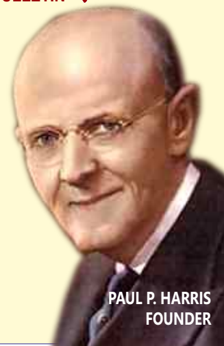
PAUL P. HARRIS FOUNDER